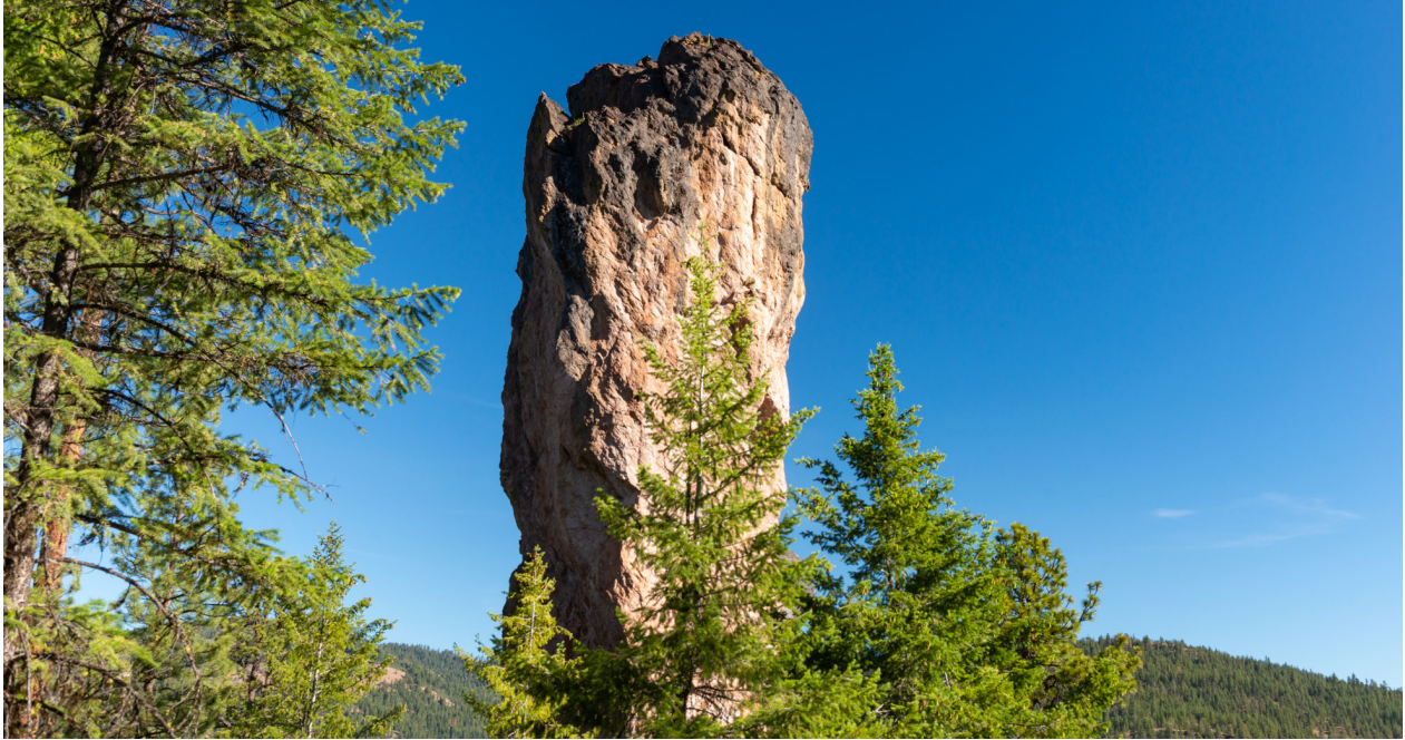
Steins Pillar in Crook County.