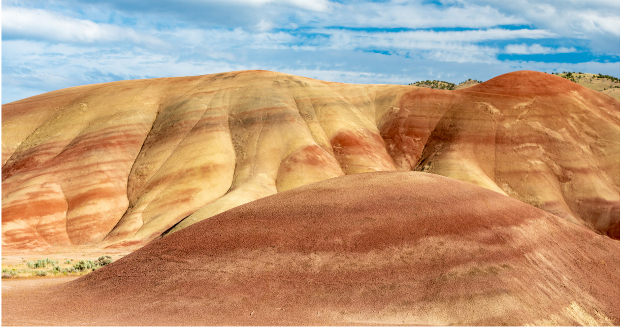
John Day Fossil Beds National Monument in Wheeler County.