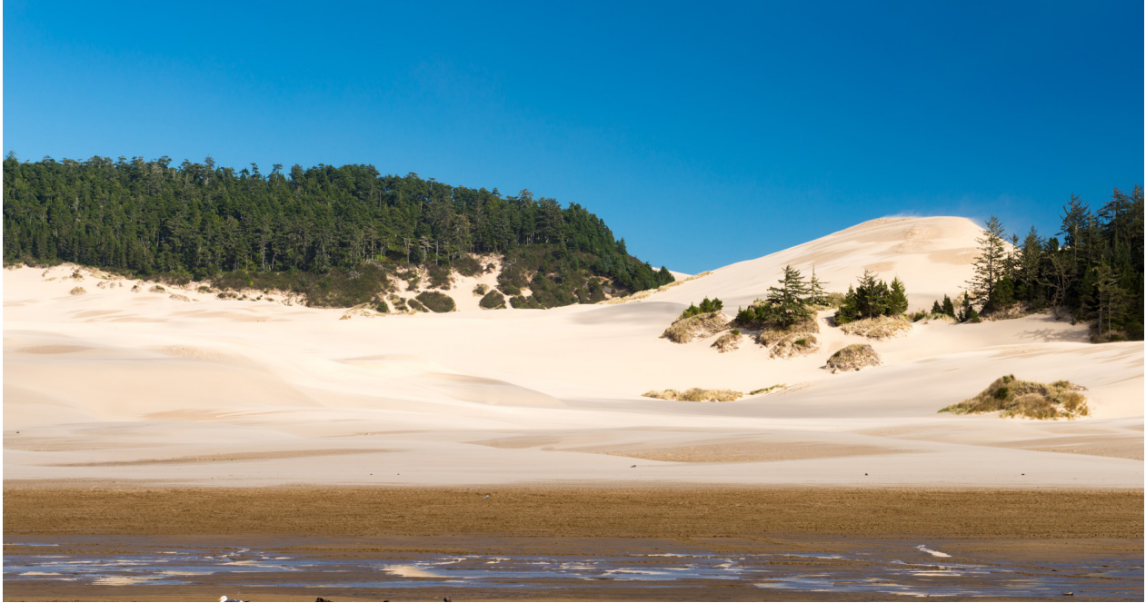
Sand dunes at Umpqua Beach in the Oregon Dunes National Recreation Area in Douglas County.