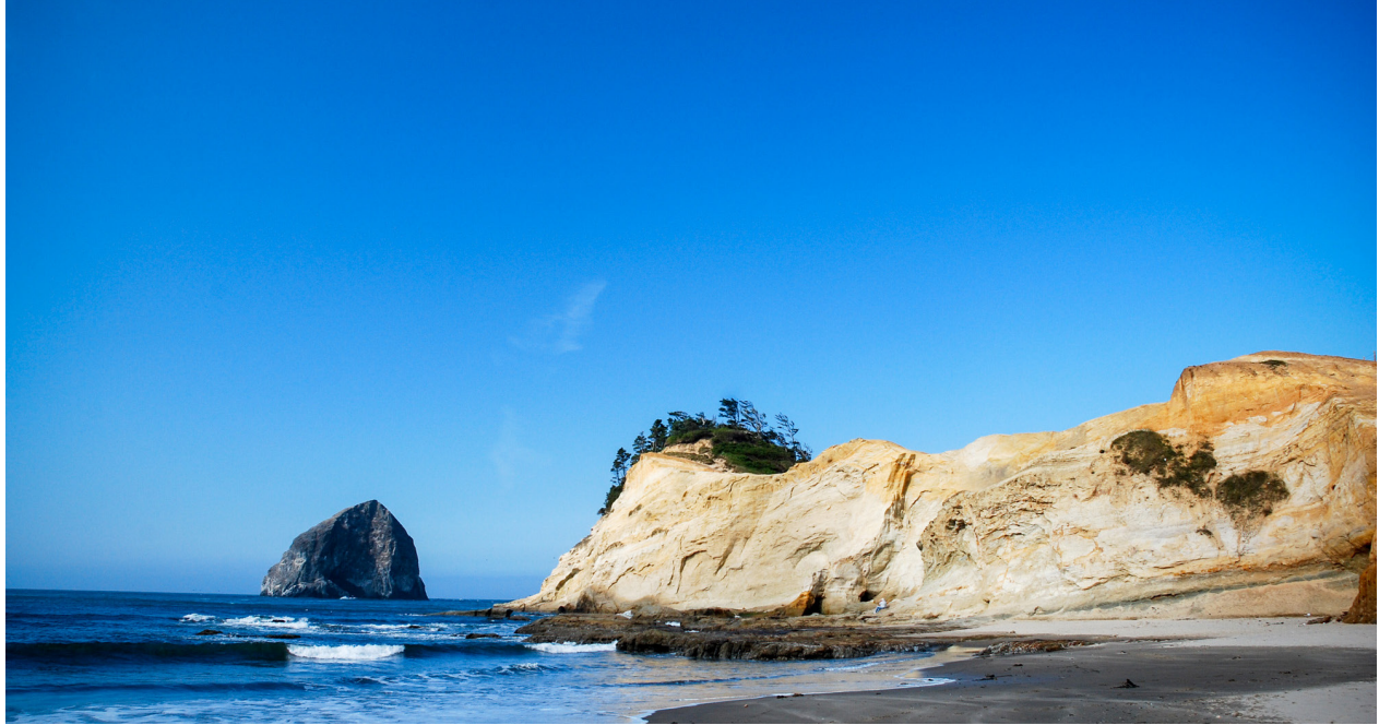
Cape Kiwanda in Tillamook County.