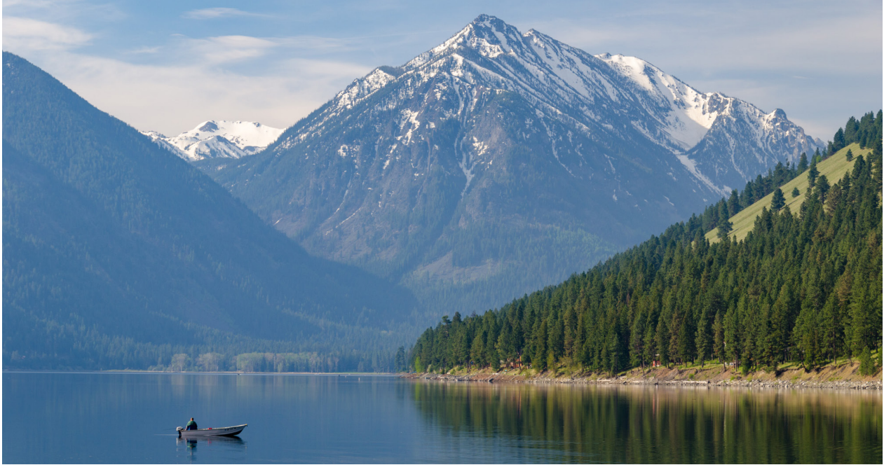
Wallowa Lake in Wallowa County.