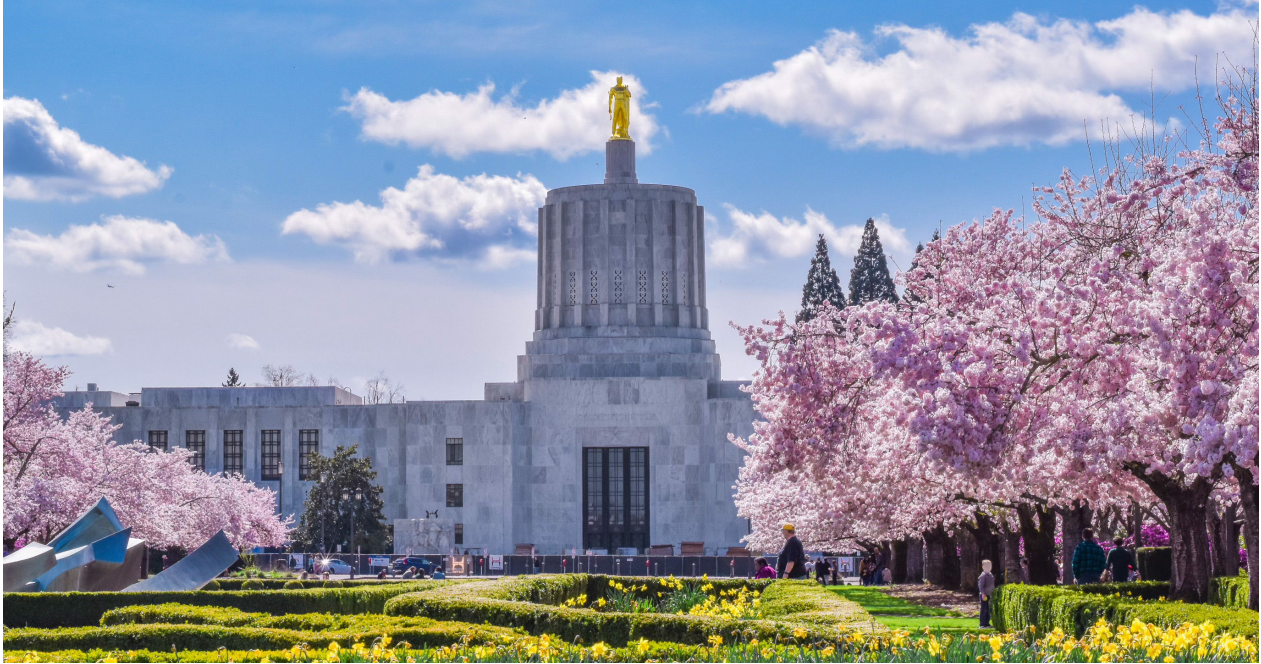
Oregon State Capitol in Marion County.