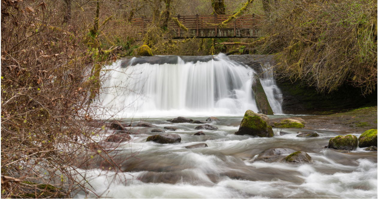
McDowell Creek Falls in Linn County.