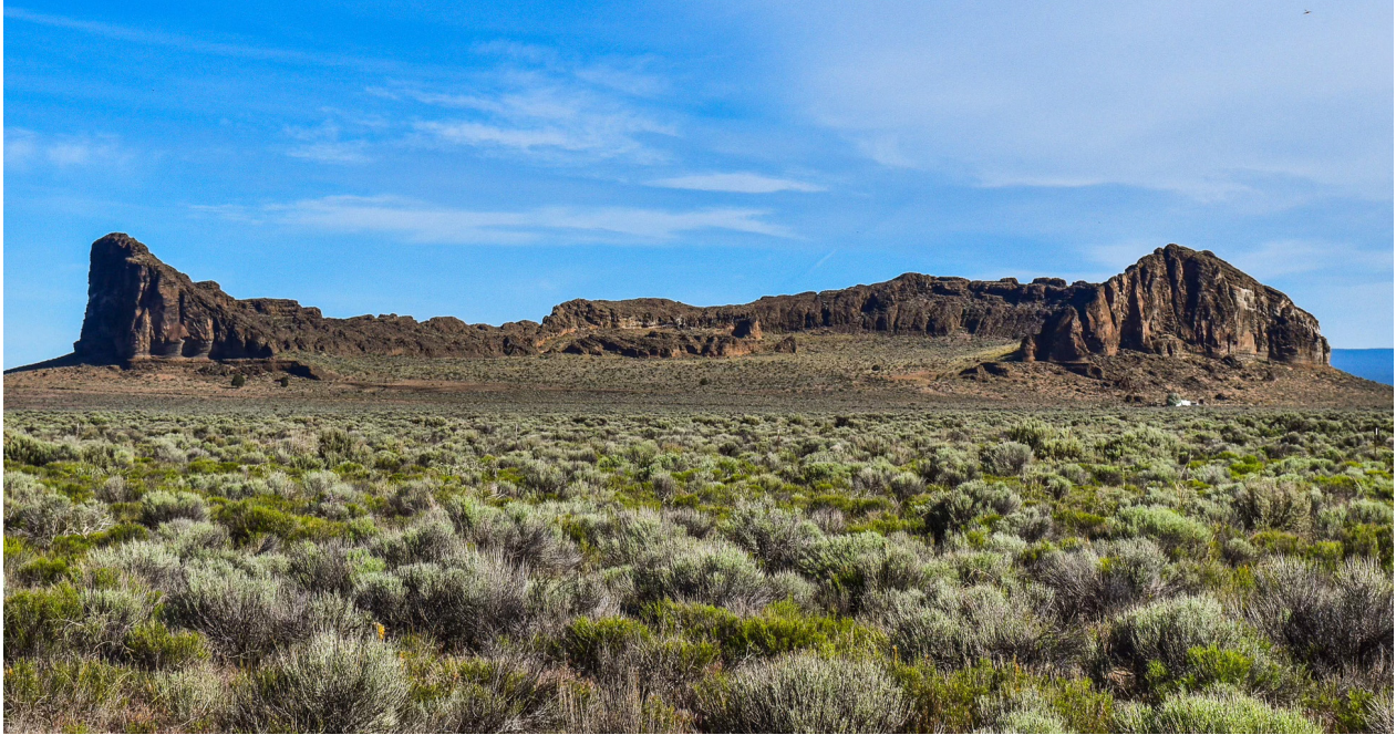
Fort Rock State Natural Area in Lake County.