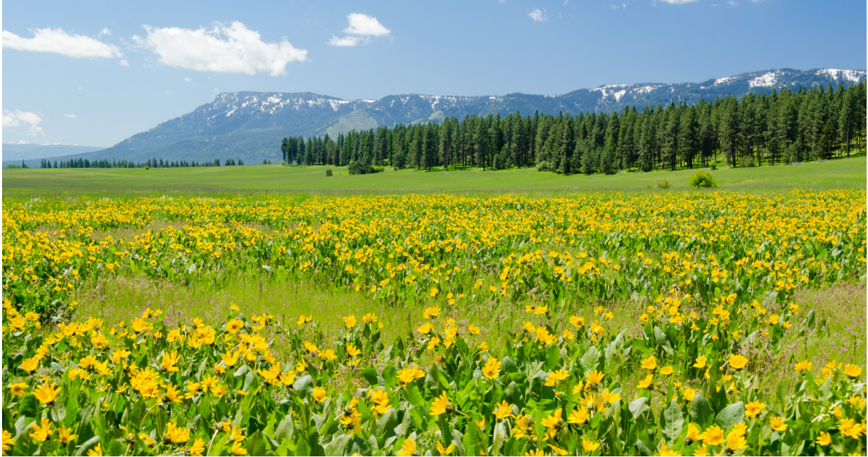
Mt. Emily in Union County.