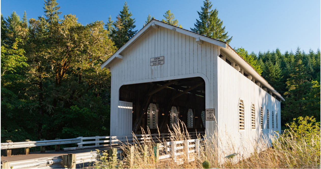
Dorena Covered Bridge in Lane County.