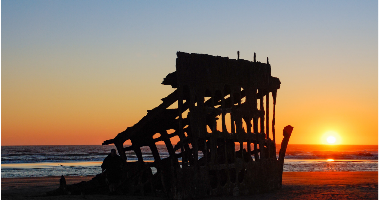
Shipwreck of the Peter Iredale in Fort Stevens State Park in Clatsop County.