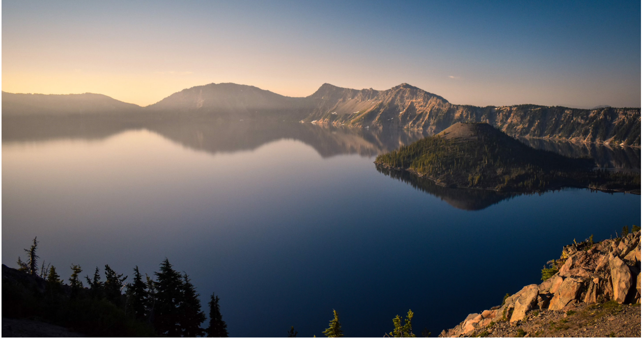
Crater Lake National Park in Klamath County.