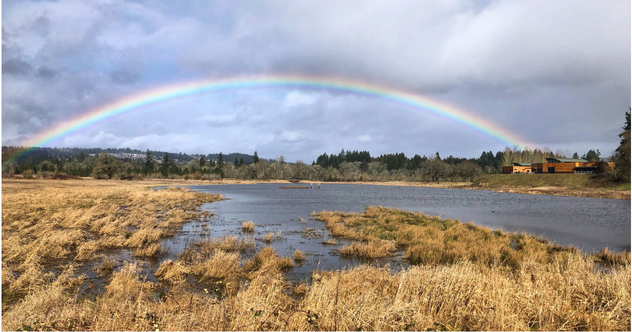
The Tualatin River National Wildlife Refuge in Washington County.