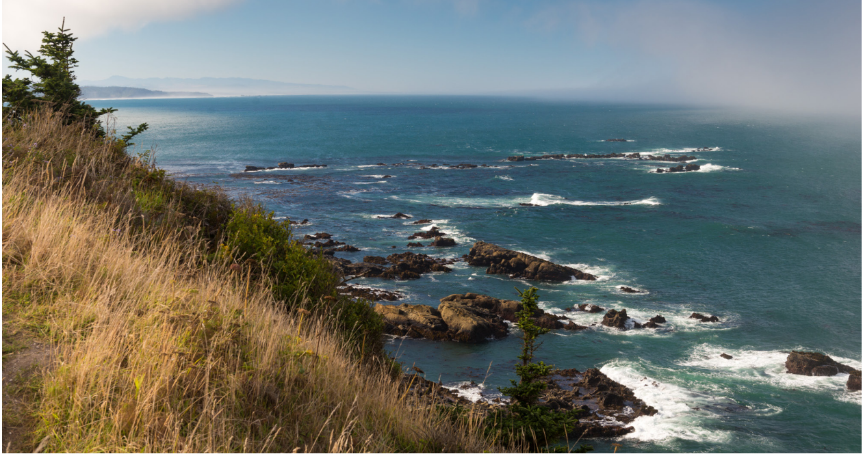
Cape Arago State Park in Coos County.