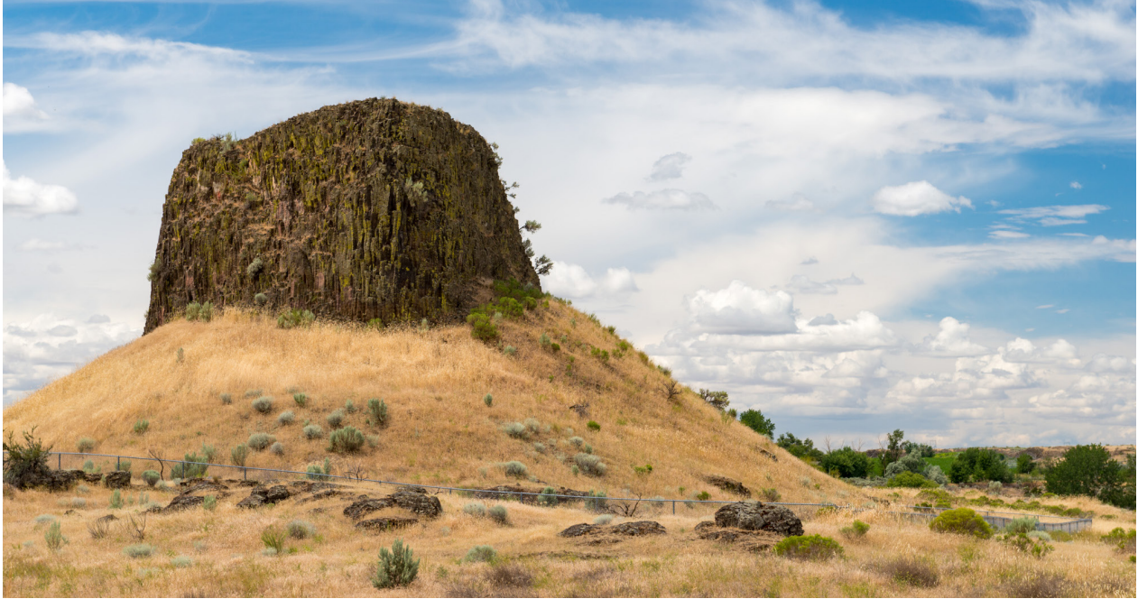
Hat Rock in Umatilla County.