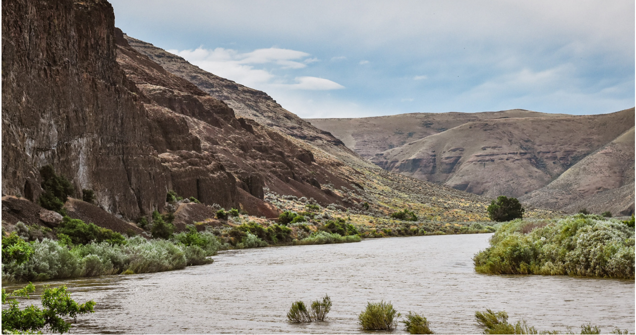
Cottonwood Canyon State Park in Gilliam County.