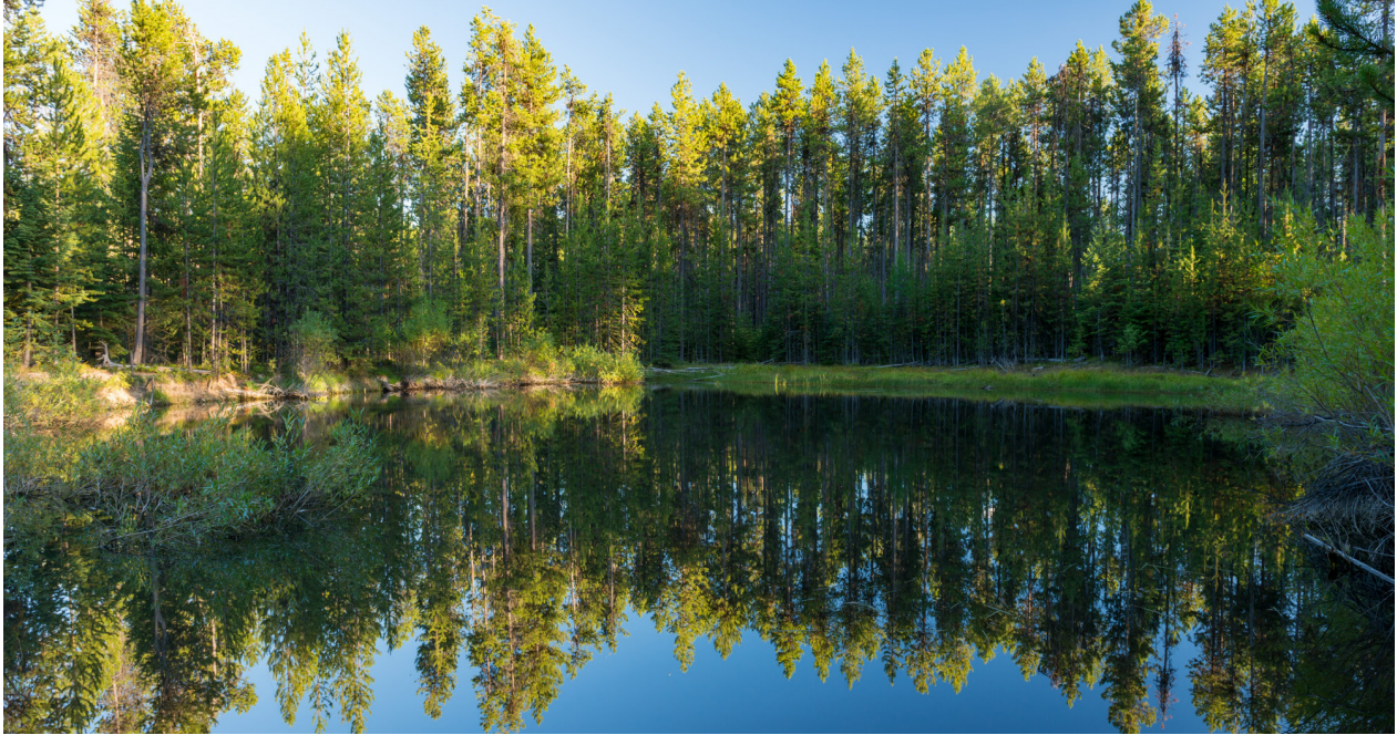
A pond along the Blue Mountain Scenic Byway in Morrow County.