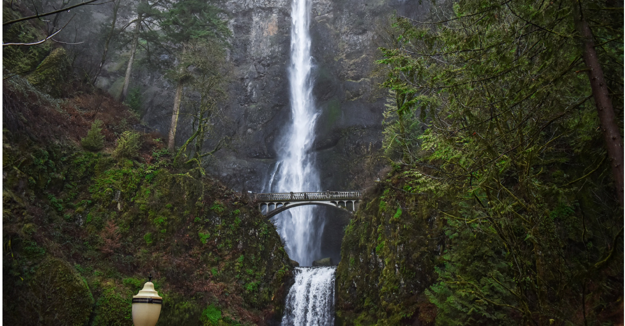
Multnomah Falls in Multnomah County.