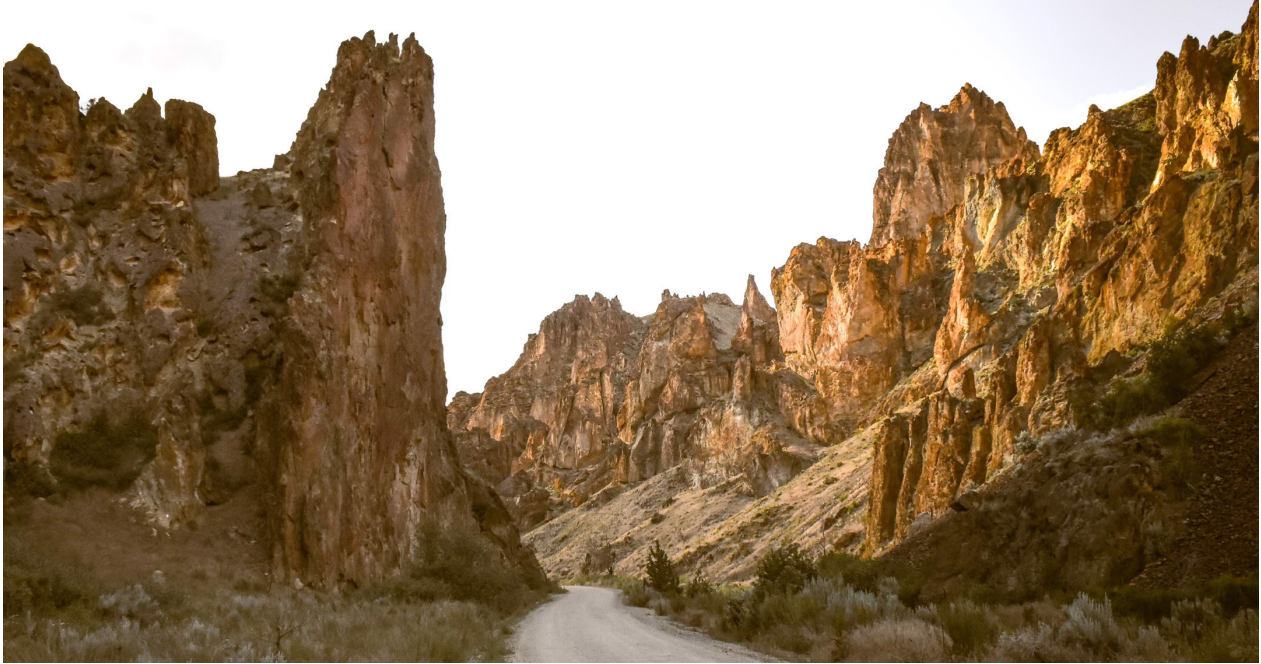
Owyhee Canyonlands in Malheur County.