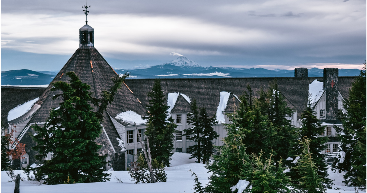
Timberline Lodge in Clackamas County.