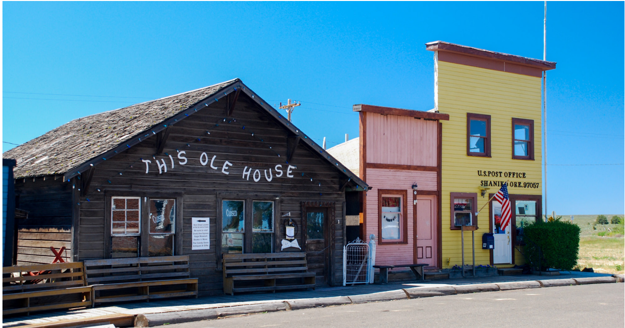
Shaniko Ghost Town in Wasco County.