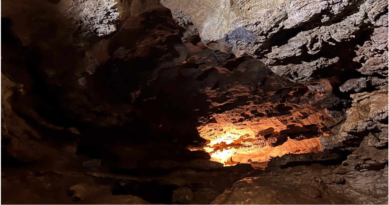
Oregon Caves National Monument and Preserve in Josephine County.