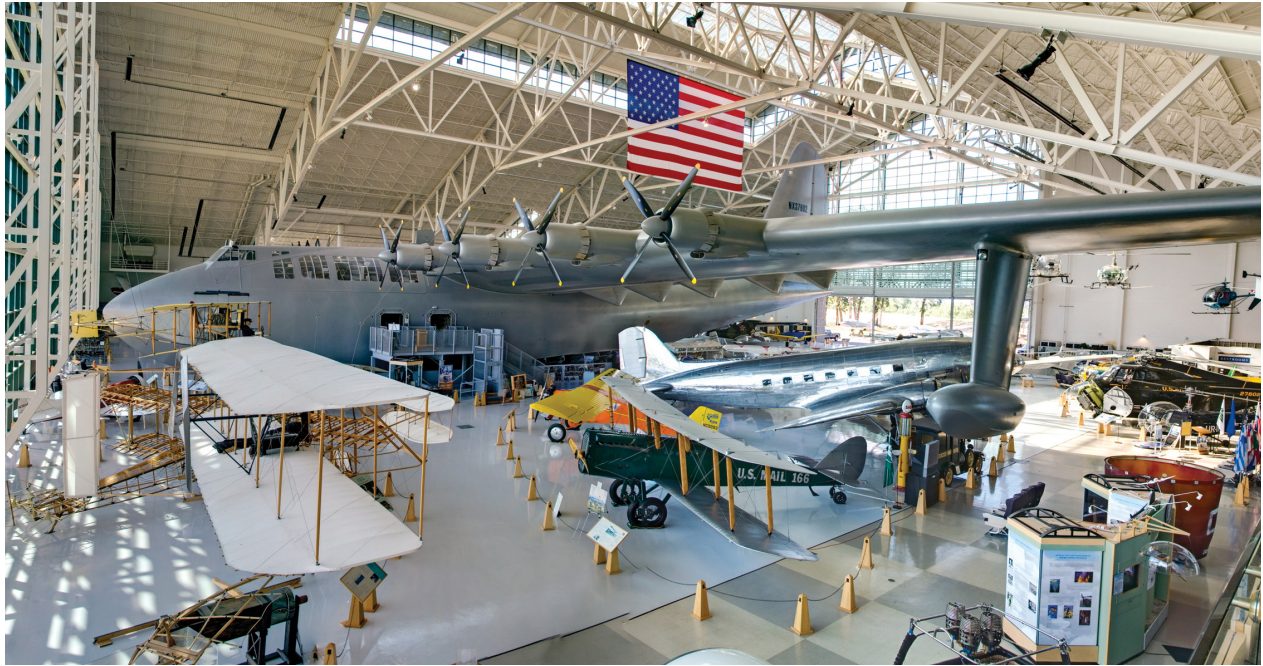
The Spruce Goose at the Evergreen Aviation and Space Museum in Yamhill County.