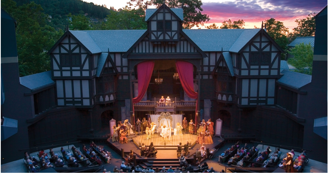
Oregon Shakespeare Festival in Jackson County.