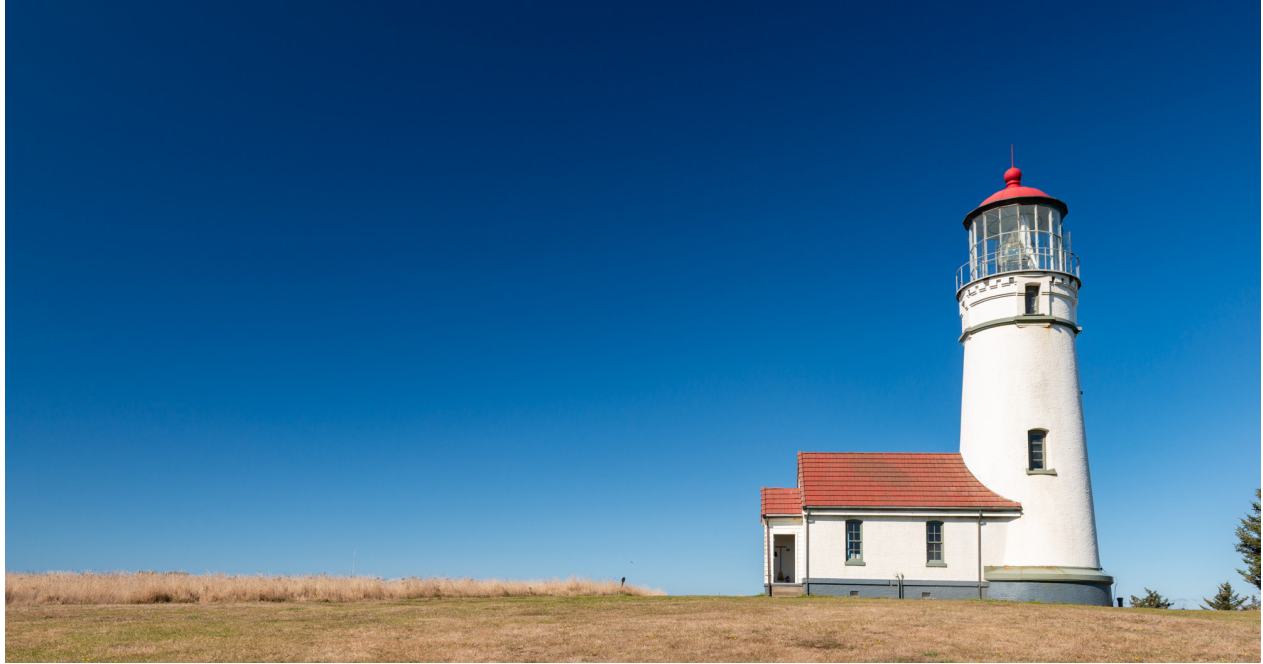
Cape Blanco Lighthouse in Curry County.