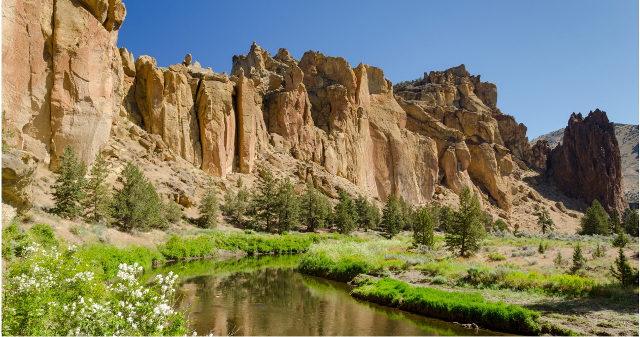
Smith Rock State Park in Deschutes County.