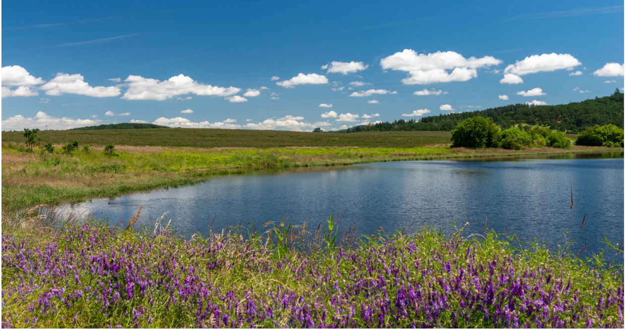
Baskett Slough National Wildlife Refuge in Polk County.