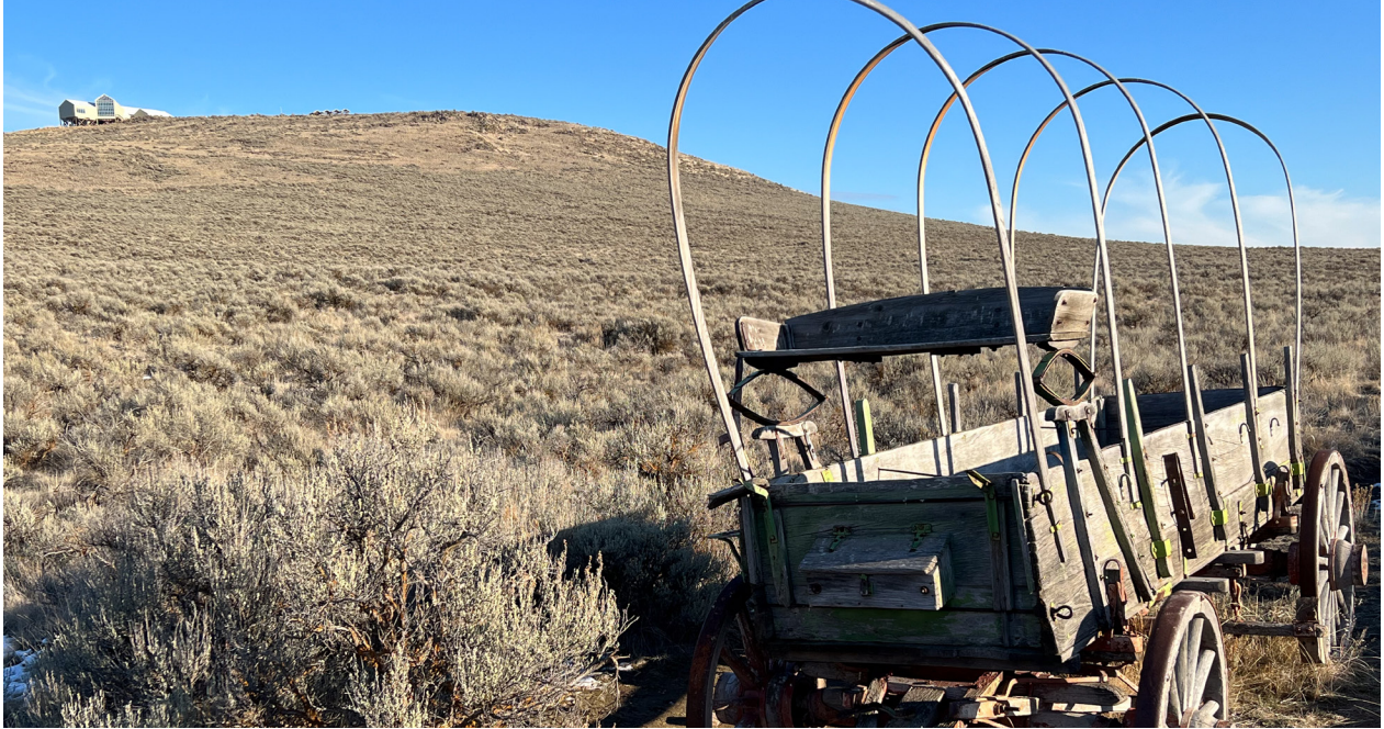
National Historic Oregon Trail Interpretive Center in Baker City, Oregon.