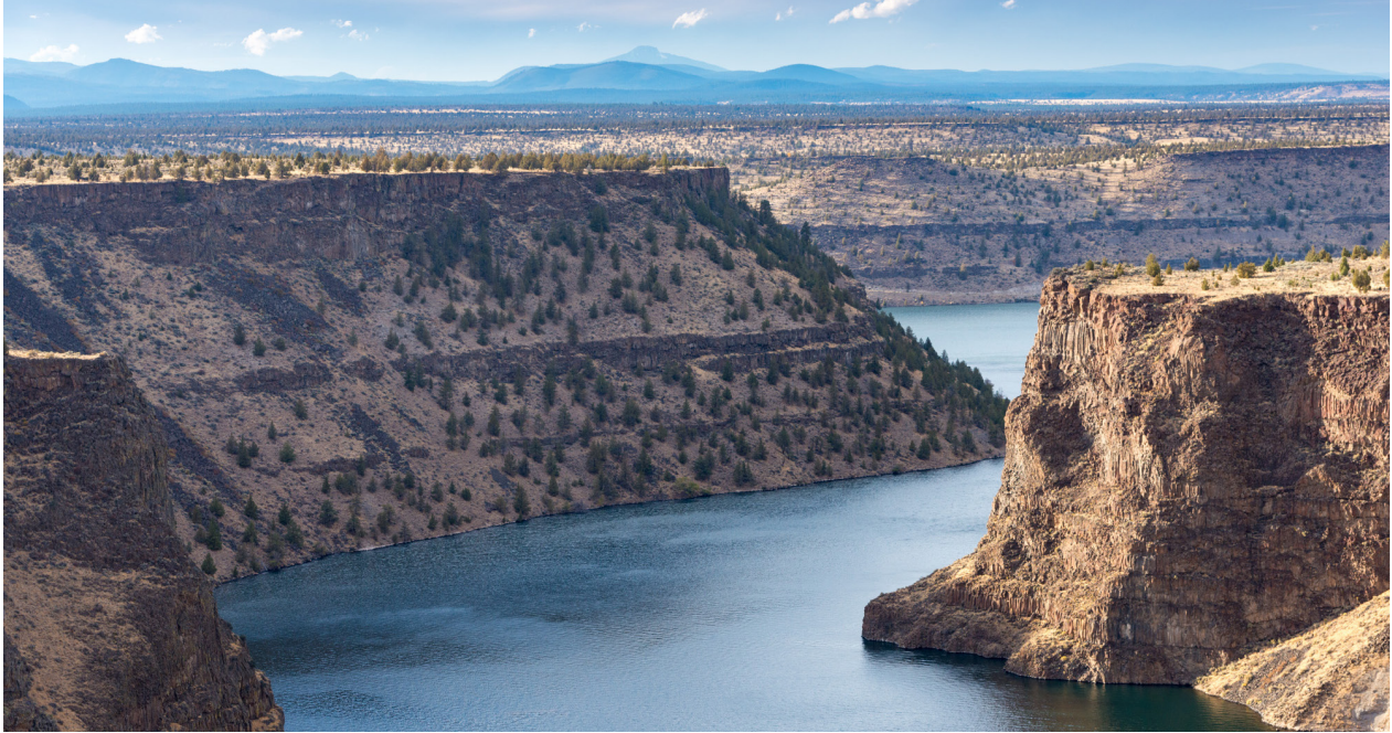
The Cove Palisades State Park in Jefferson County.