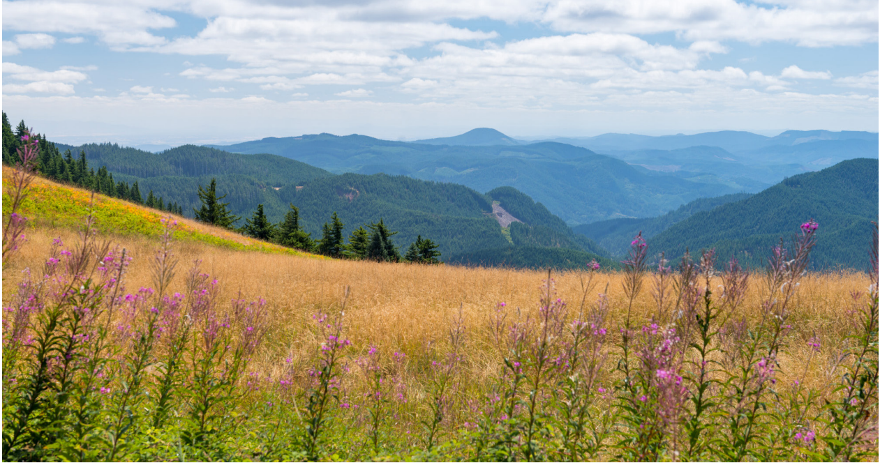
Marys Peak in Benton County.