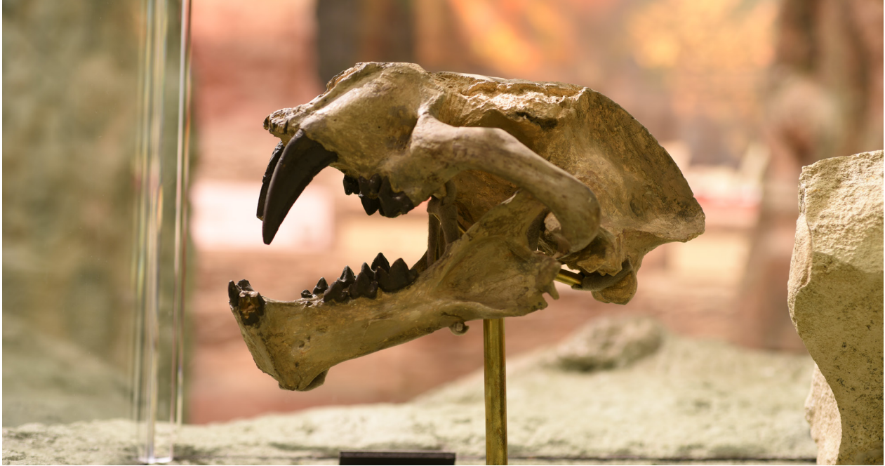
A fossil exhibit at the Thomas Condon Visitor Center in Grant County.