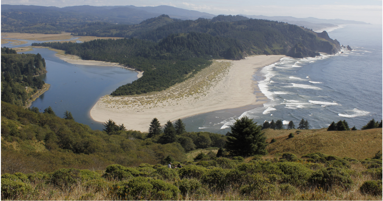
Cascade Head in Lincoln County.