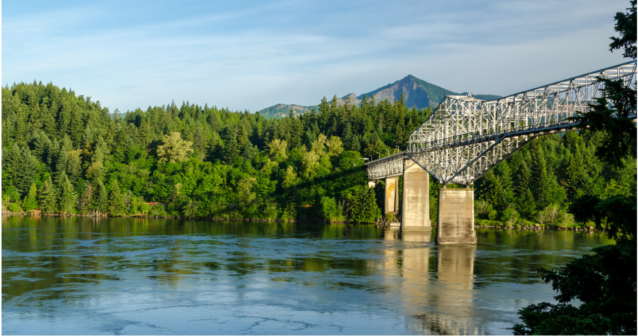
The Bridge of the Gods in Hood River County.