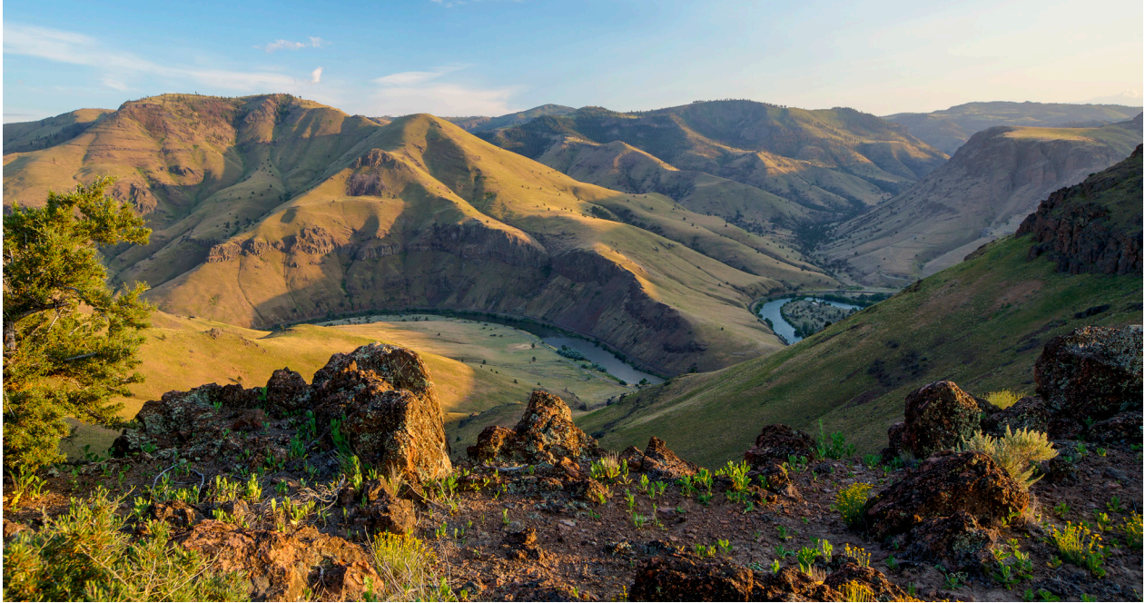
Macks Canyon in Sherman County.