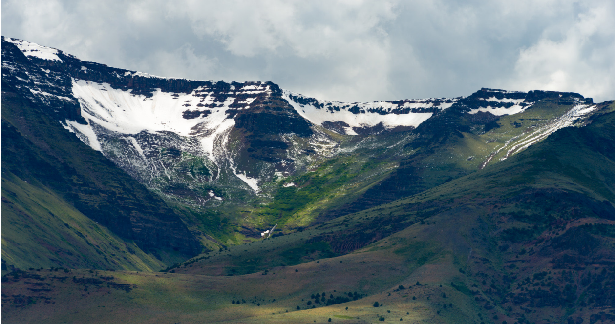
Steens Mountain in Harney County.