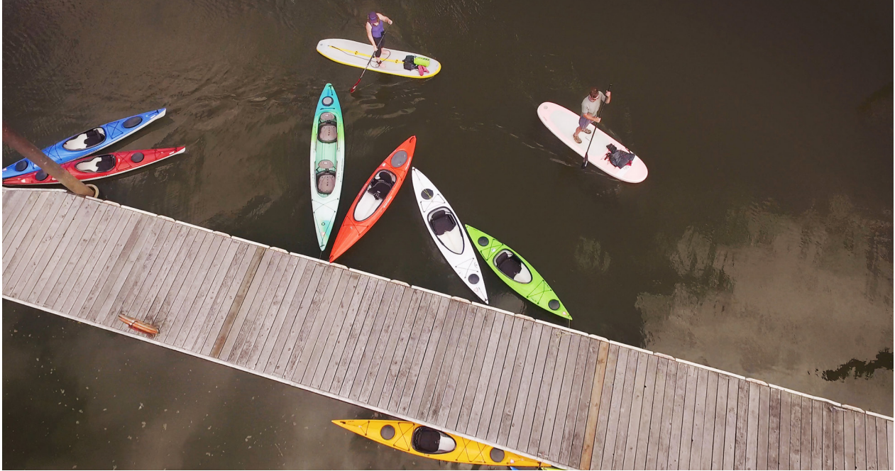
Scappoose Bay in Columbia County.