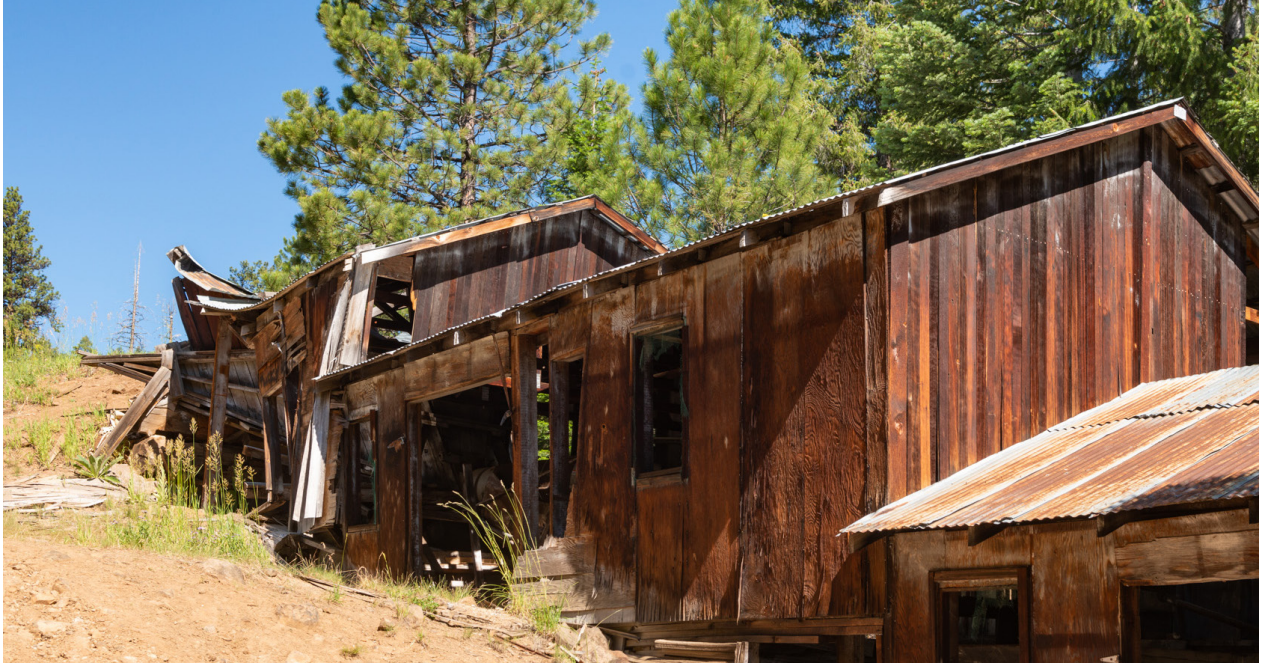
Abandoned mines at the Ochoco National Forest in Crook County.