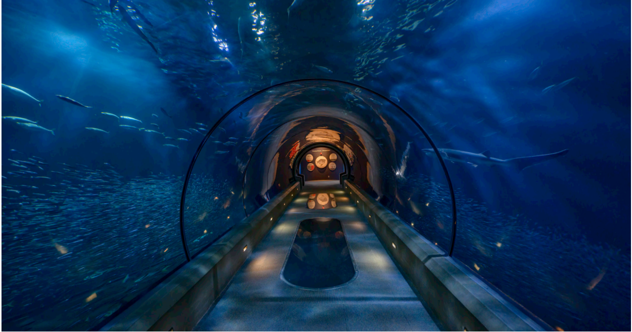
Oregon Coast Aquarium in Lincoln County.