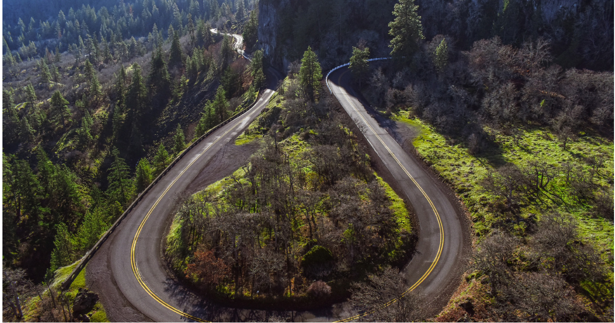
Rowena Crest in Wasco County.