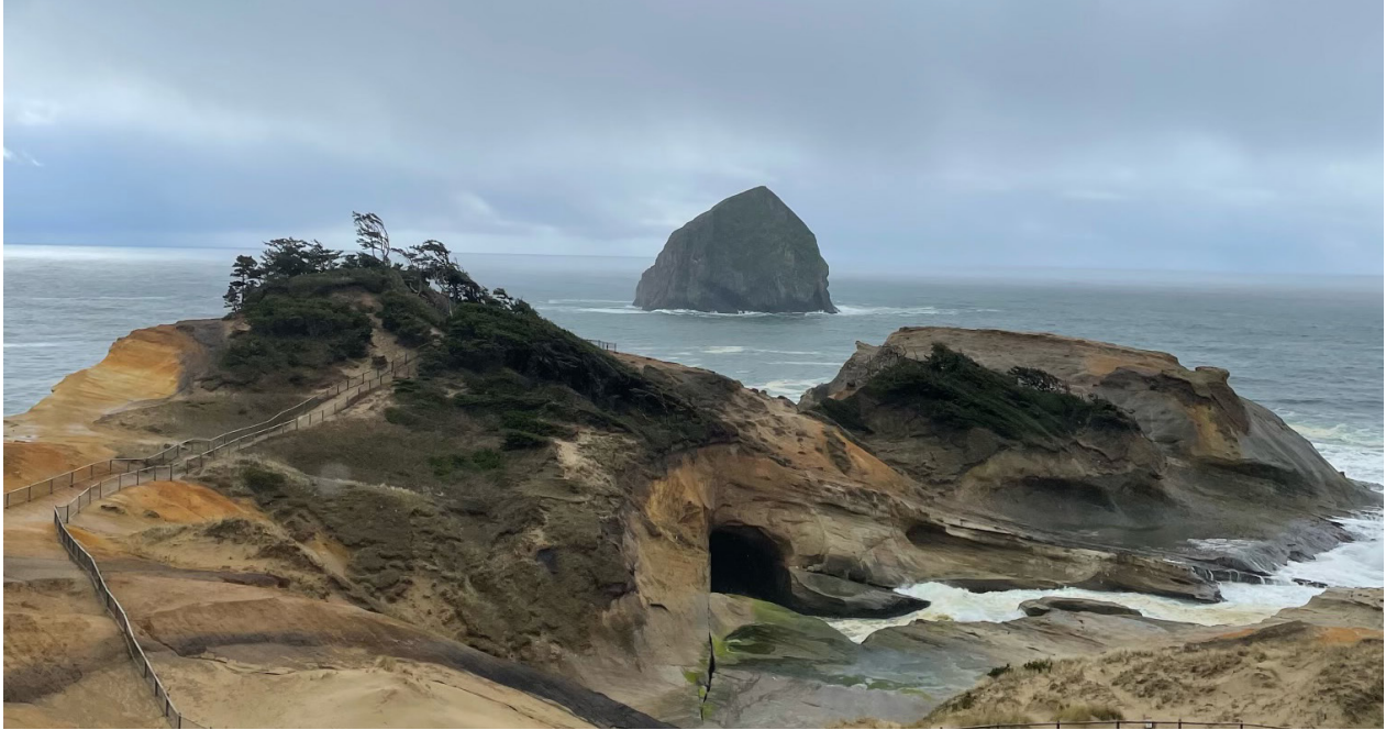
Cape Kiwanda in Tillamook County.