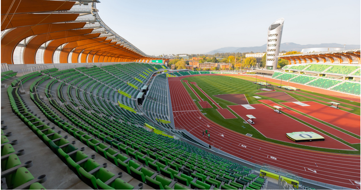
Hayward Field at the University of Oregon in Lane County.