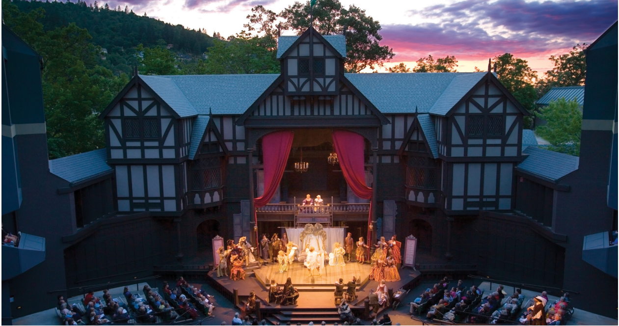
Oregon Shakespeare Festival in Jackson County.