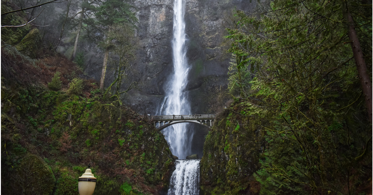
Multnomah Falls in Multnomah County.