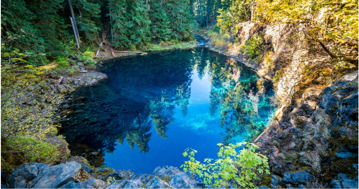
Tamolitch Blue Pool in Willamette National Forest.