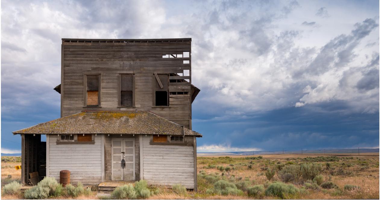
A building in Kent in Sherman County.