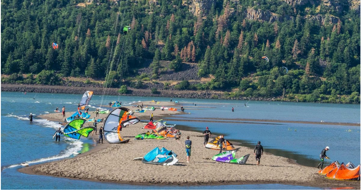
The Event Site in Hood River County.