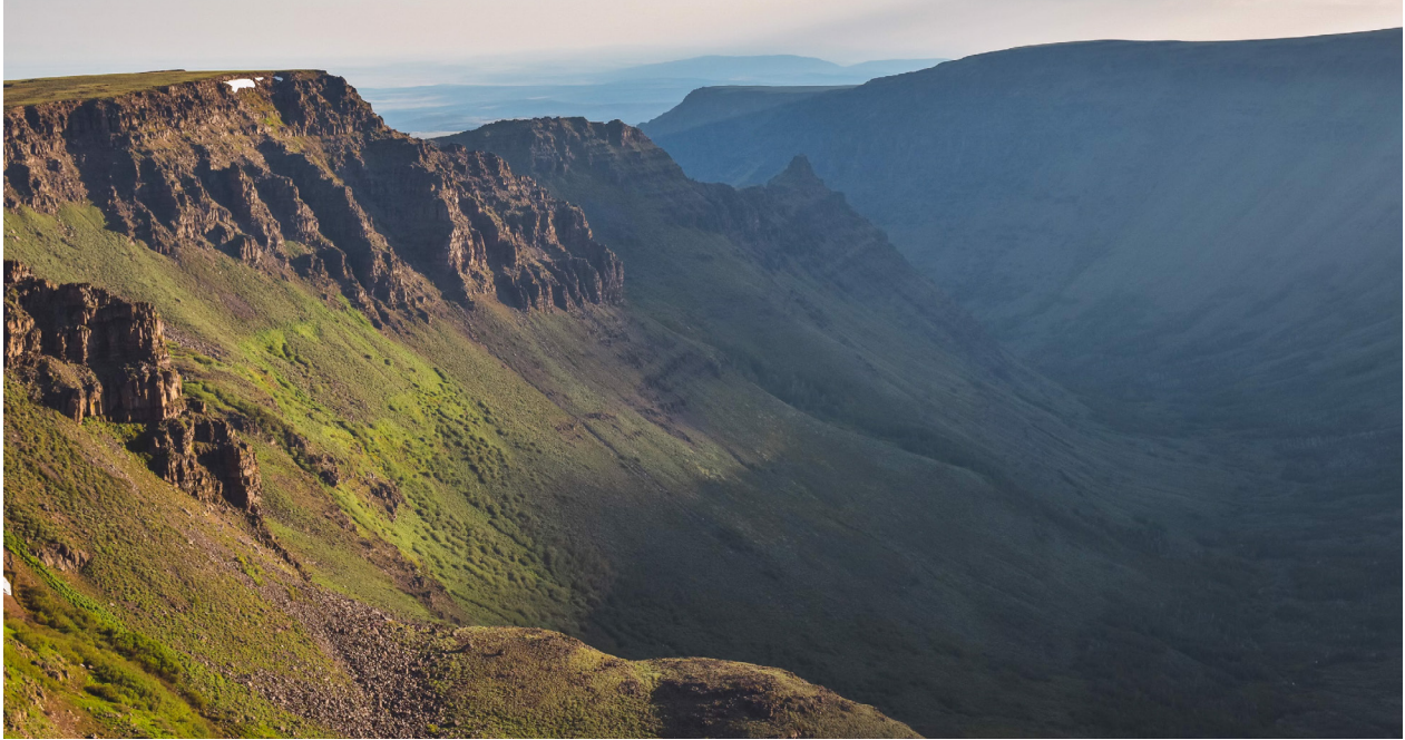
Steens Mountain in Harney County.