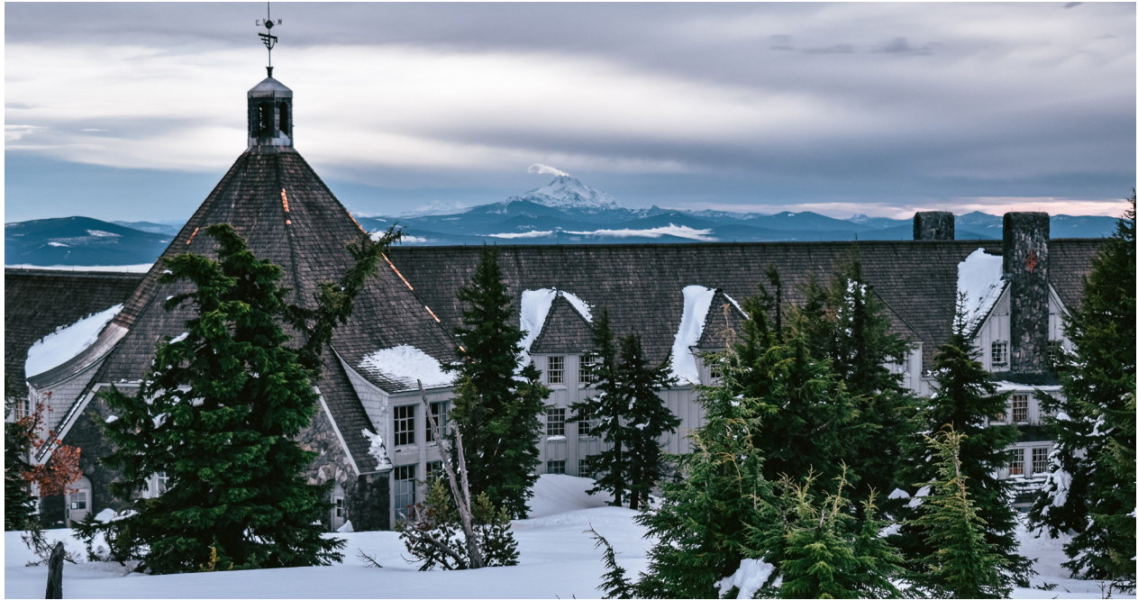
Timberline Lodge in Clackamas County.