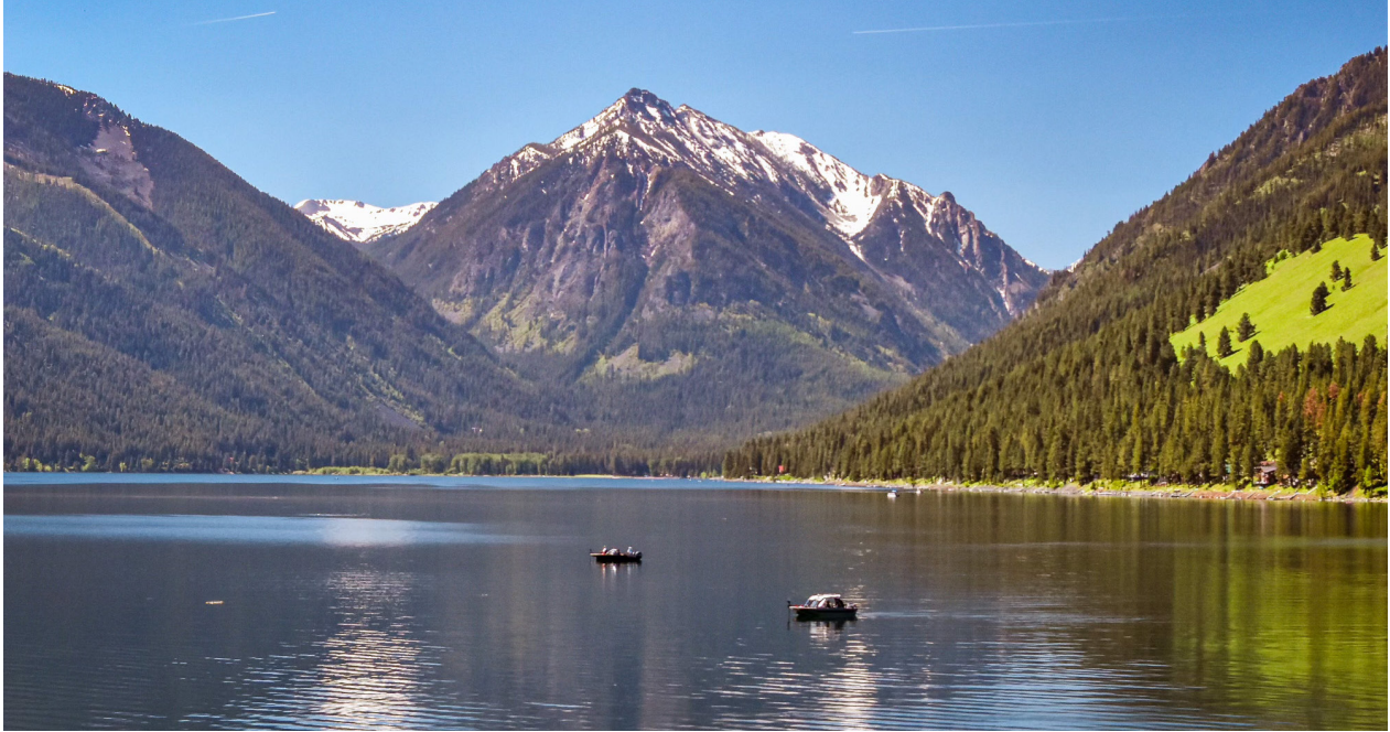
Wallowa Lake in Wallowa County.