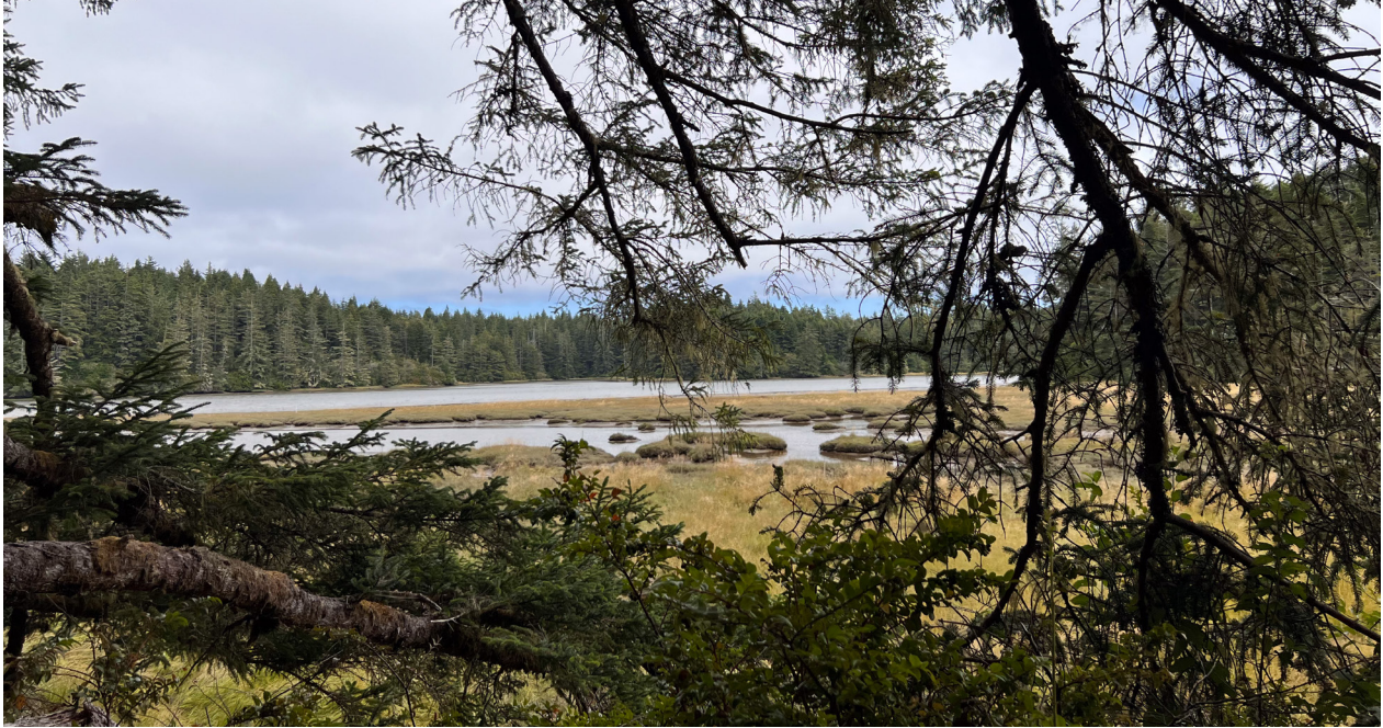
South Slough National Estuarine Research Reserve in Coos County.