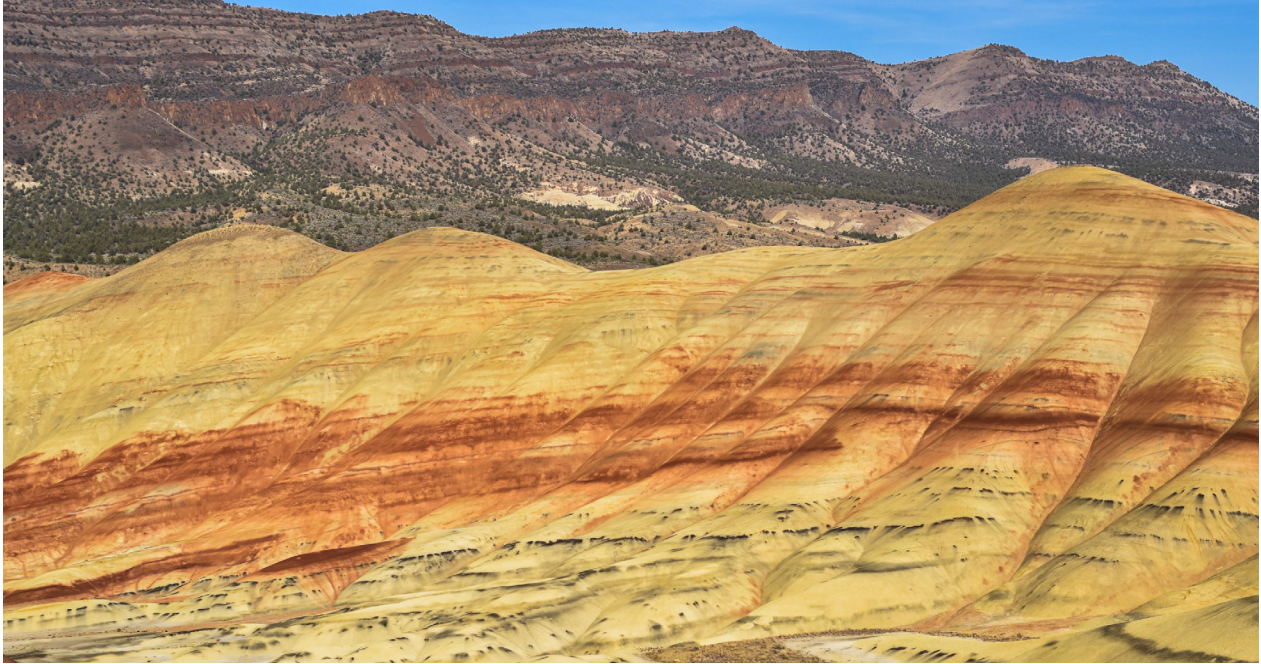
John Day Fossil Beds National Monument in Wheeler County.