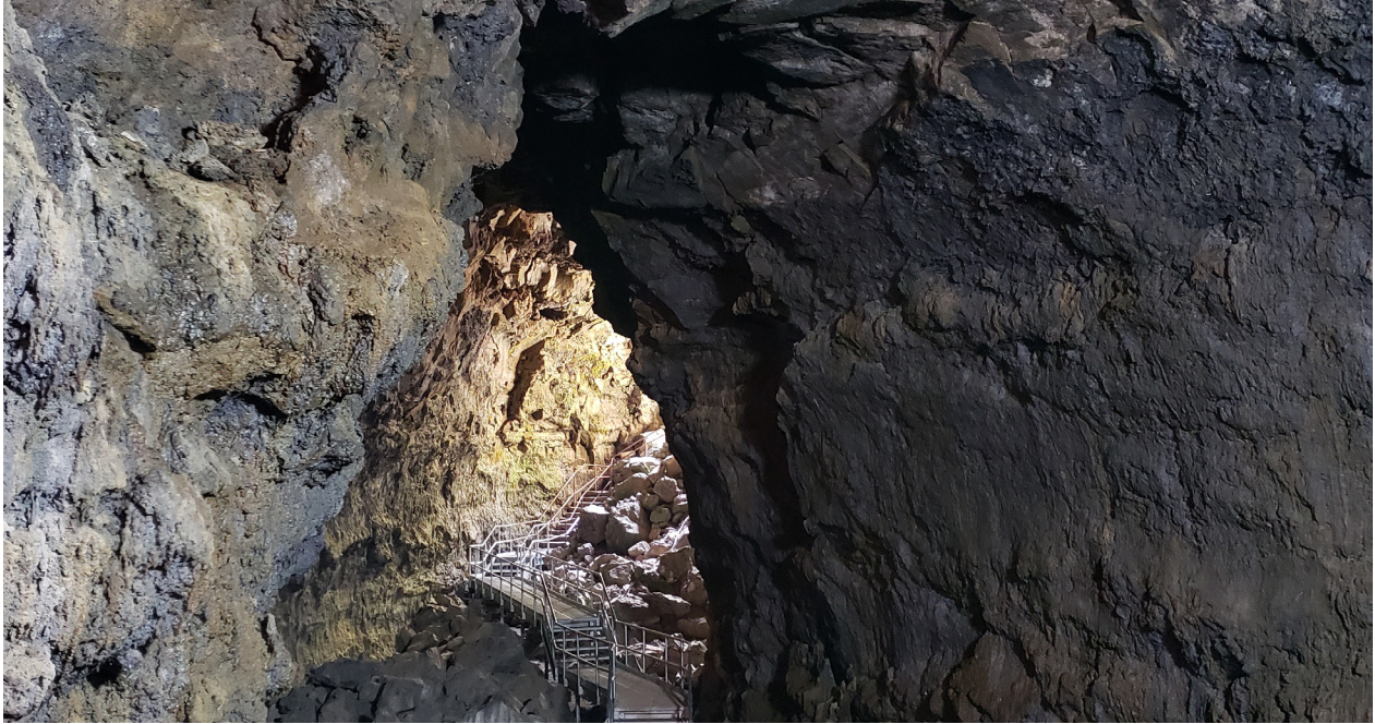
Lava River Cave in Deschutes County.