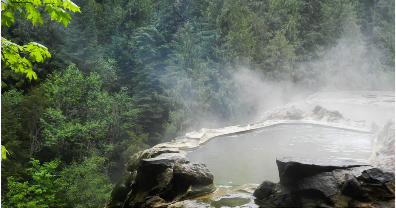
Umpqua Toketee Hot Springs in Douglas County.