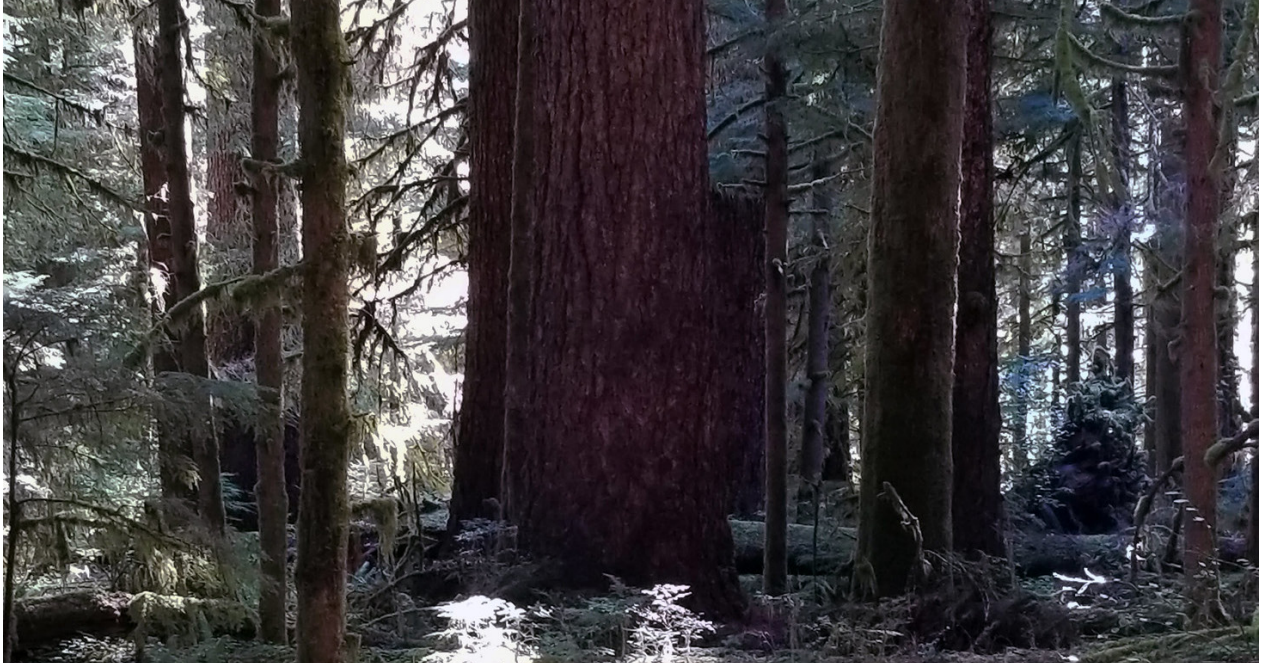
Valley of the Giants in Polk County.