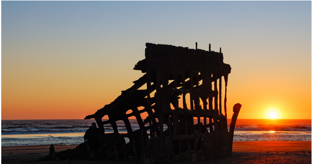
Shipwreck of the Peter Iredale in Fort Stevens State Park in Clatsop County.