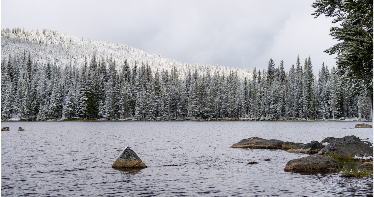
Anthony Lakes Mountain Resort in Union County.